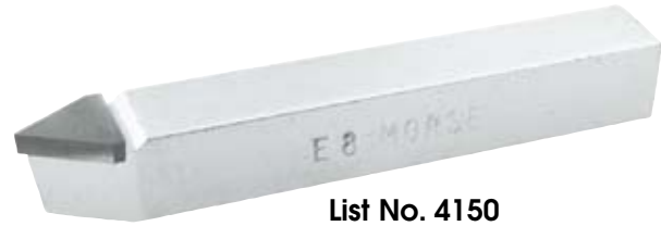
List No. 4150