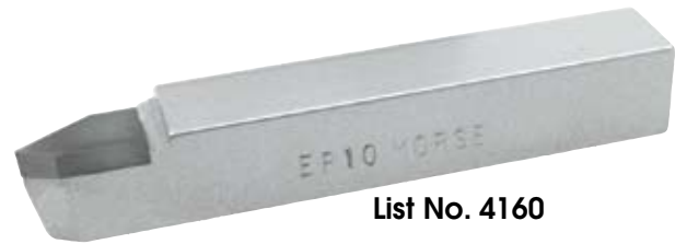
List No. 4160

STANDARD PACKAGE E4-E8 — 10 each E10 — 5 each