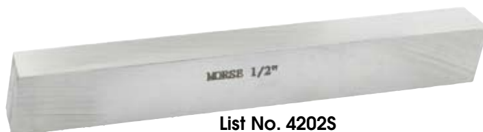
List No. 4202S