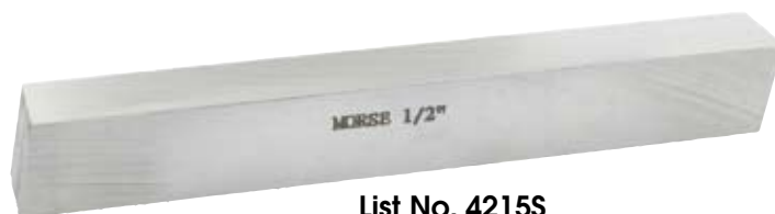
List No. 4215S