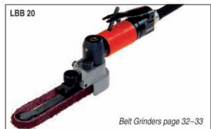
Belt Grinders page 32–33