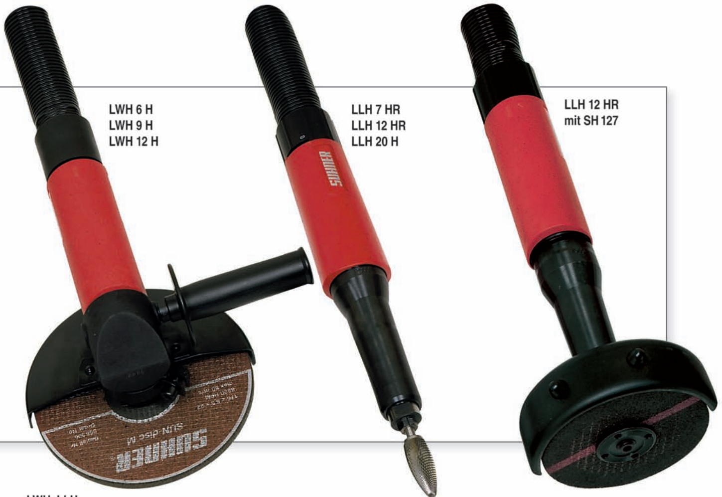
LWH 6 H LWH 9 H LWH 12 H