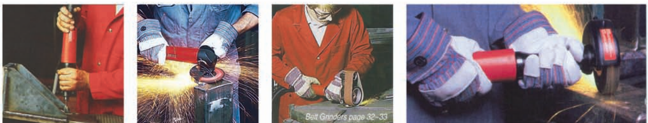
Belt Grinders page 32-33