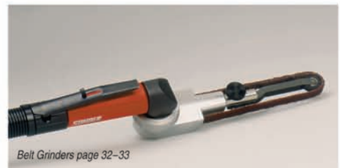
Belt Grinders page 32-33